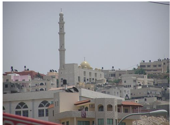
Minaret in the Palestinian Territories

Swiss voters just approved legislation that will ban the construction of new minarets. The five existing minarets will continue to be permitted and the construction of new mosques and other Islamic prayer facilities are also not affected. The Swiss vote is seen as a backlash against the threat of Islamic fundamentalism and there are indications that the vote has encouraged right of center political parties in Austria, the Netherlands and Denmark to also seek the banning of minarets in their countries.